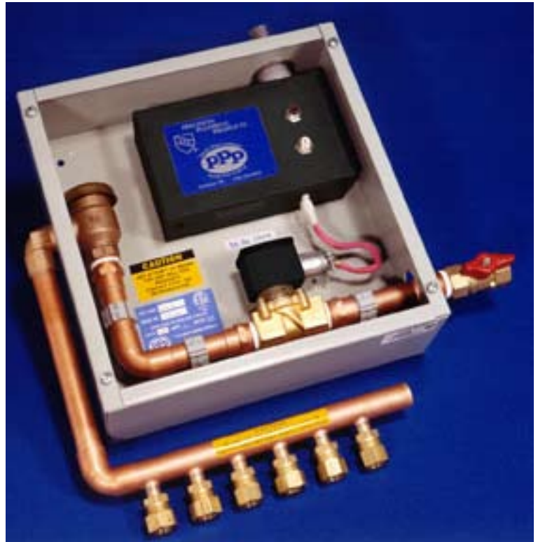
SURFACE MOUNT CABINET

PTS-4 4 OPENING MANIFOLD - THRU - PTS-2130 30 OPENING MANIFOLD