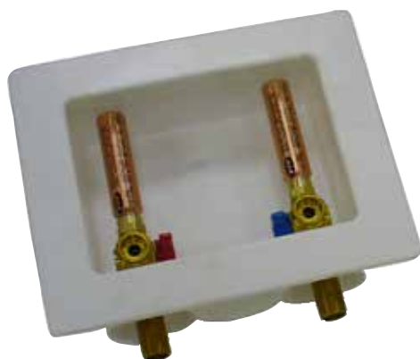
Plastic Laundry Box MM-500PLB

Precision Plumbing Products has designed a plastic/metal laundry box assembly that makes your installation simple and cost effective. Solenoid operated laundry equipment can create destructive water hammer due to quick closing valves on the fill cycle. Water hammer can damage or even break your hose connections as well as destroy the solenoid valve. To avoid this common household problem hook your washing machine hose connectors to the quarter turn ball valve in our laundry box assembly with water hammer arrestors and rest easy.