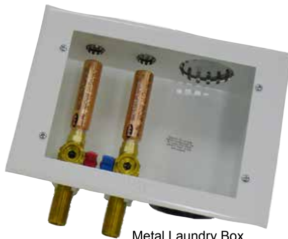
Metal Laundry Box MM-500MLB